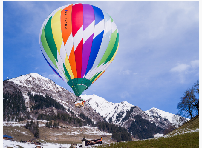
Balloon over target