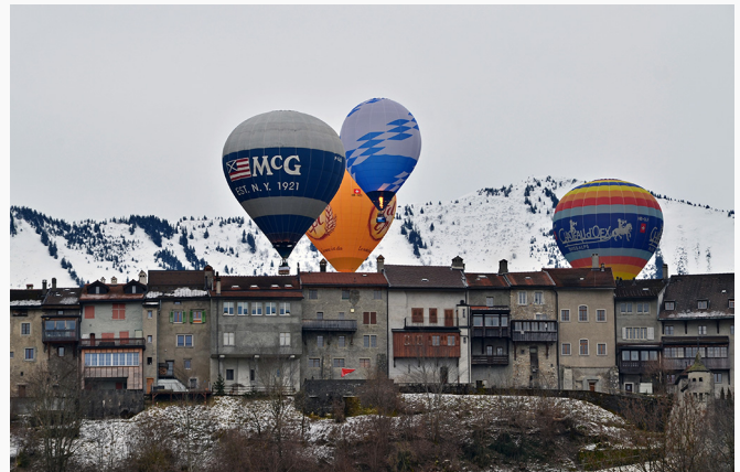
Castle of Gruyère